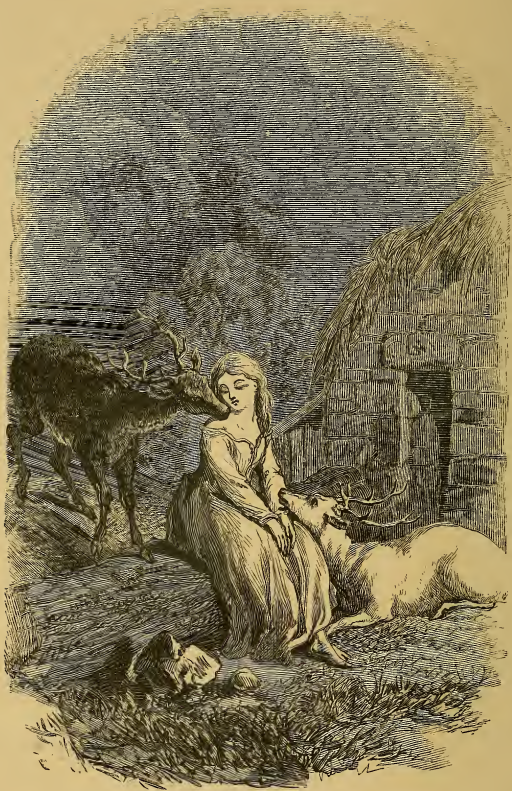
THE SPOTTED DEER.